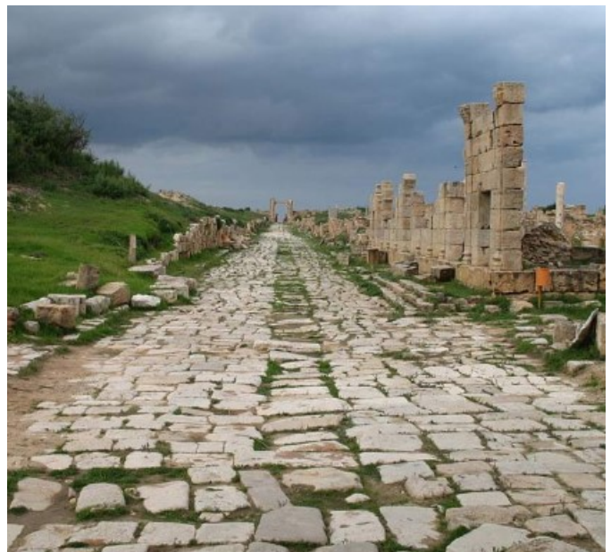
An example of a Roman road