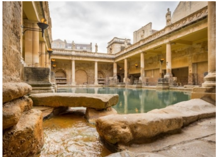
An example of a Roman bath