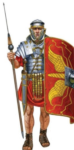
Roman soldiers used the 'Testudo' in battle

This is what a Roman soldier would have looked like