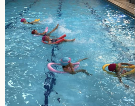
PE Year 1 swimming