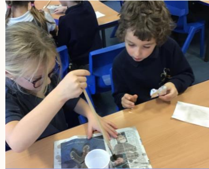
SCIENCE Year 2 testing materials