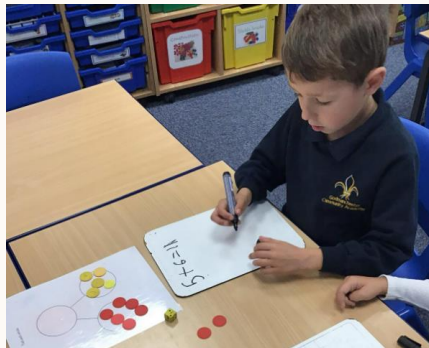
MATHS Year 1 Number