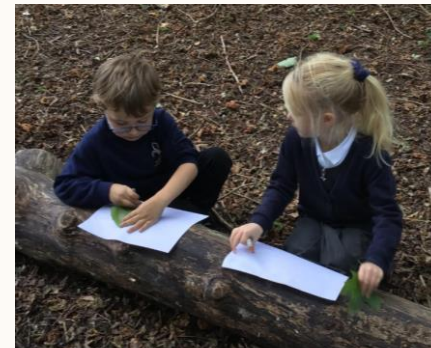
ART Year 1 Seasons