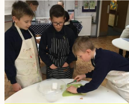
DT Year 5 Indian Food