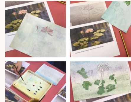
ART Year 5 Monet